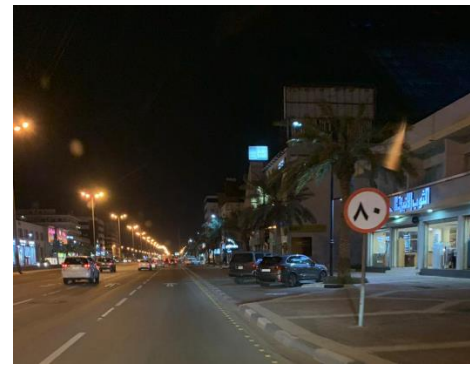
b. Speed limit on arterial at WZ 2