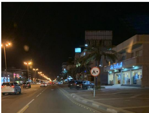
c. Commercial activities directly accessible from arterial at WZ 2