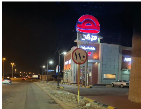
a. Speed limit on arterial at WZ 1

The study covers in its geographical scope cities of Dammam Metropolitan Area (Dammam, Khobar, and Dhahran) in The Eastern Province of The Kingdom of Saudi Arabia as shown in Fig. 2. DMA contains multiple arterial roads to connect the three cities: Dammam Khobar and Dhahran.