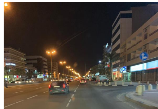
d. Commercial activities directly accessible from arterial at WZ 2