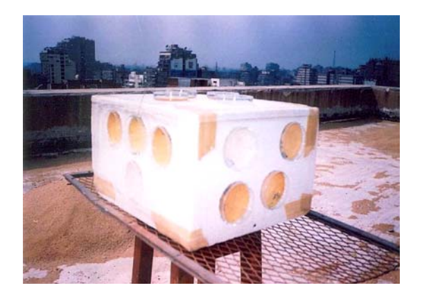
Fig. 1 A polystyrene cube with Petri dishes containing the different fungal media

The exposed plates were incubated for 5–7 days at 28°C, the resultant colonies were counted and expressed as colony forming unit per plate per hour (CFU/p/h). Colonies were isolated, purified and identified to the genus level; with the exception of Aspergillus , which was identified to the species level. Identification was done using macroscopic and microscopic features