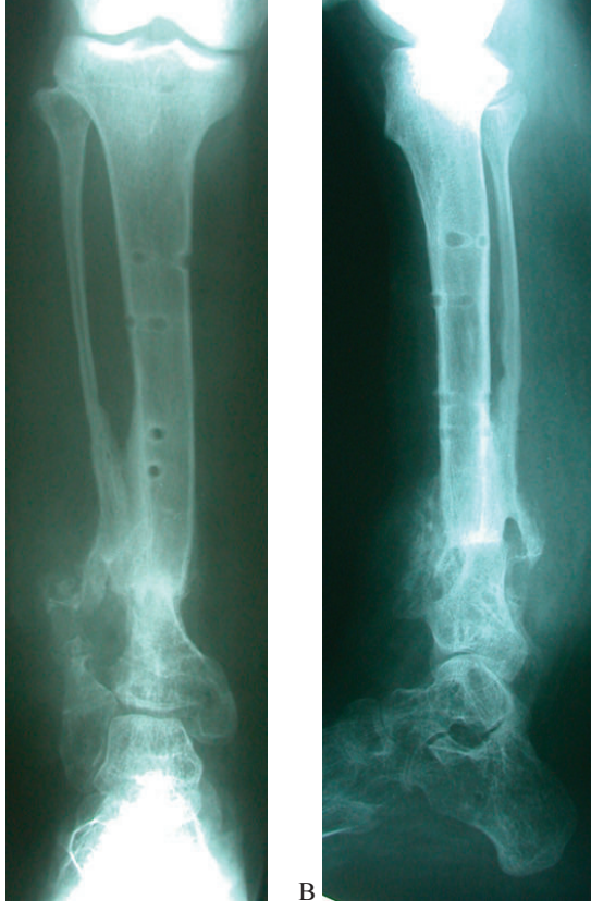
Fig. 5. Solid union and deformity correction: (A) Anteroposterior, (B) Lateral view.

Postoperatively gradual correction of deformity was done utilizing TSF online software program (Smith & Nephew, Memphis, TN USA) (Figs. 4A, B). Full correction was achieved within 74 days. The patient was mobilized with full weight bearing as tolerated. Union was reached after six months of treatment. This was followed by removal of the frame one month later, after frame dynamization (Figs. 5A, B). The patient continued to utilize braces for four months postoperatively, with 11cm leg length discrepancy remaining (Figs. 6A, B, C) and was able to walk for the first time in his life without crutches utilizing a shoe raise of 7 cm. The patient has been followed for 4-years now, and currently is undergoing lengthening using a second TSF. The patient had an excellent range of motion after surgery of 10° planter-flexion and 40° dorsi-flexion, and the range remained unchanged with no further improvement in plantar flexion during the follow-up period.