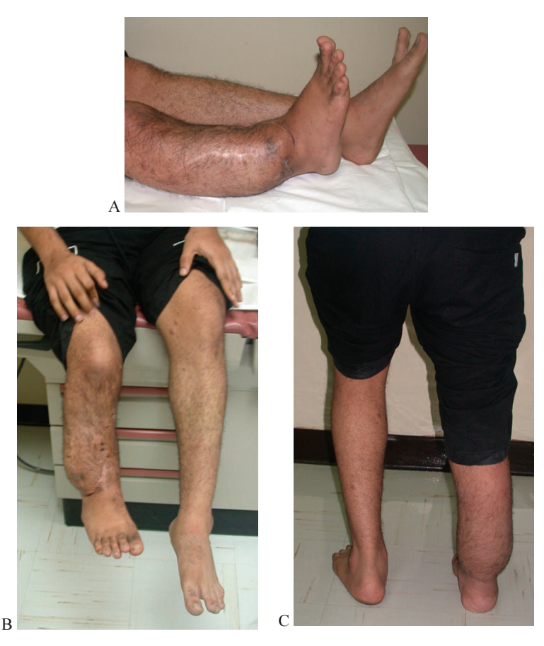
Fig. 6. Full correction of the deformity: (A) Lateral, (B) Anterior view. (C) From posterior, standing with FWB.