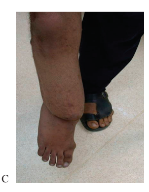
Fig. 1. Preoperative pictures of our patient with CPT demonstrate the obvious deformity. (A) Lateral view. (B) Anterior with weight bearing and (C) Anterior without weight bearing.

The patient was taken to operating room where standard ring first TSF technique was applied proximally and distally on the tibial segments[10]. Then an 8 cm long incision was made at non-union site, where excision of pseudarthrosis was done. It was ensured that all dysplastic bone has been removed from both sides of the pseudarthrosis site until healthy bleeding bone, though keeping the resection to the