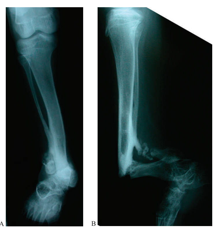
Fig. 2. Preoperative X-ray is showing the anteromedial angular deformity of Rt tibia. (A) Anteroposterior. (B) Lateral view.

minimum to avoid unnecessary bone loss. Removal of thickened fibrous tissue of previous surgeries was also performed. However, the deformity was not corrected acutely because of the soft tissue contracture. The proximal fixation included four-half pins of 6 mm in diameter (hydroxyapatite coated). Distally it was utilized 1.8 mm Ilizarov wires X 5 (Smith & Nephew, Memphis, TN USA) holding the short distal fragment. Grafting with periosteum from the iliac crest was performed as follows; periosteum was harvested from the inner table of the iliac crest and was meshed like the split thickness skin graft, and was applied on top of the cleaned pseudarthrosis site. Iliac crest bone graft and 10 cc of DBM (Grafton, Osteotech, Inc., Eatontown, NJ, USA) were performed, then closure in layers (Fig. 3A, B).