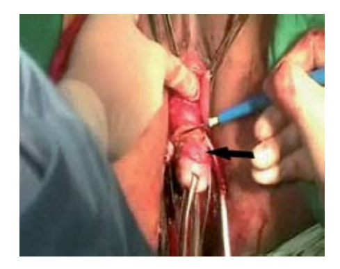
Figure 2 - The cervix is amputated.