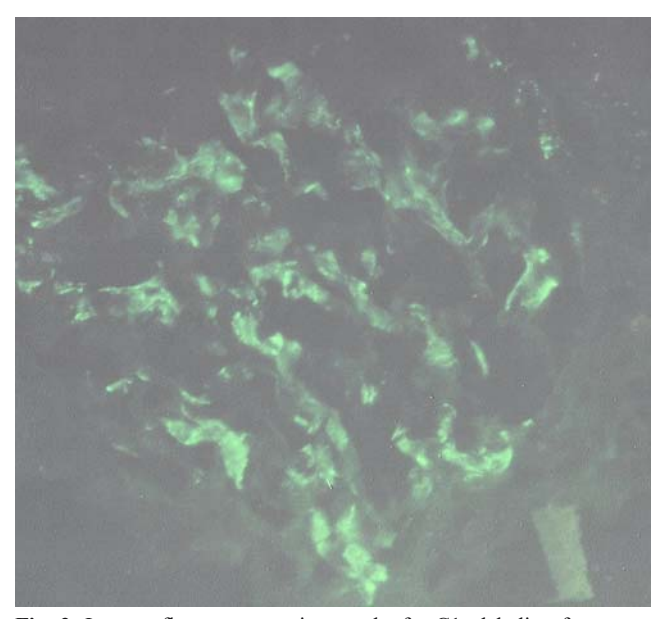
Fig. 2 Immunofluorescence micrographs for C1q labeling from case 2; the glomerulus shows positive immune reaction in the mesangial area